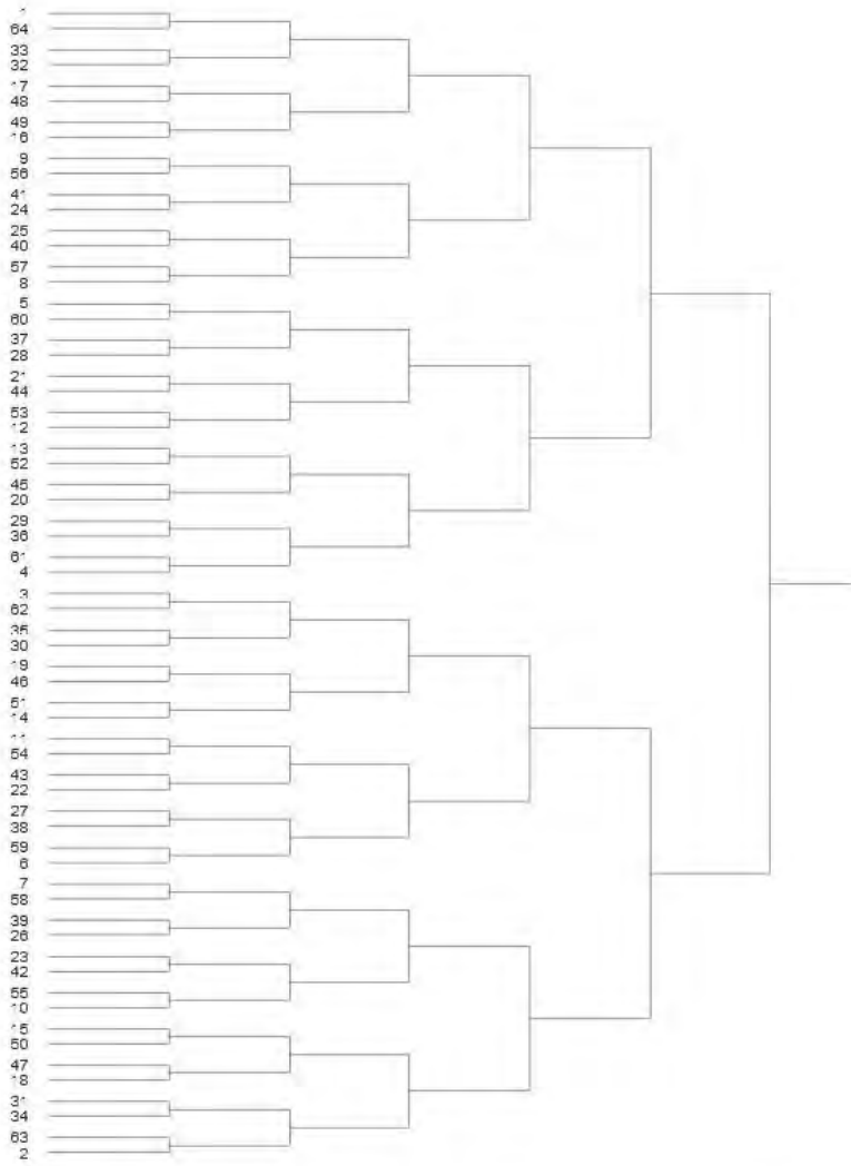
Figure 7a. Bout plan for individual direct elimination (table for 64 fencers)