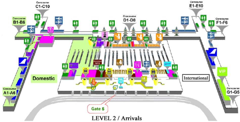
Meeting Point at Suvarnabhumi International Airport, GATE 5

The 3 rd Asian Veteran Fencing Championships 2017 50 th TFF Anniversary